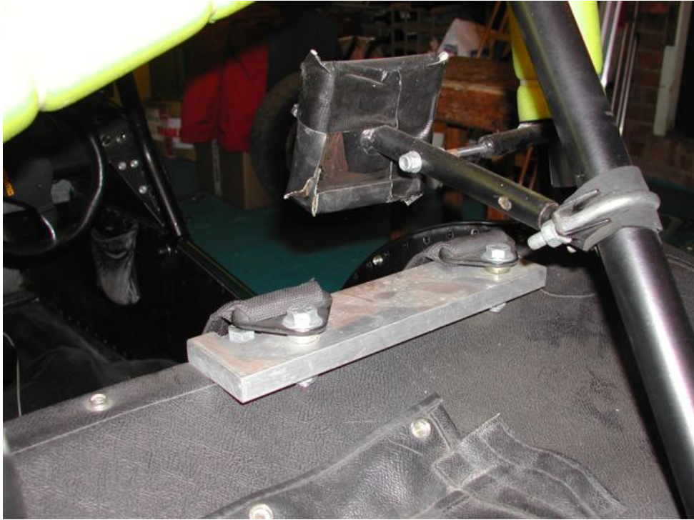
Harness plates secured with washers and nyloc half-nuts on underside of adapter plate.